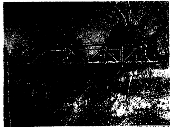
02-249-AA02-03-001 MB 01/11/06 Profile Looking West Roberts Rd. @ Panther Creek