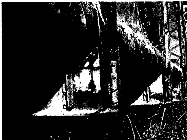
02-249-AA02-03-001 MB 01/11/06 Missing Bolt To Floorbeam, 3rd From South, East End Roberts Rd. @ Panther Creek