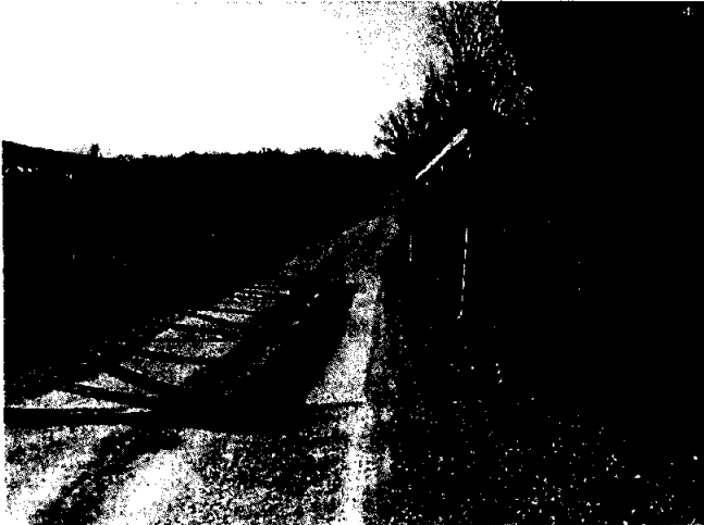
02-249-AA02-001 JEC 01-30-2008 Roberts Road (Pct.2) over Panther Creek Weight Limit Sign Looking South