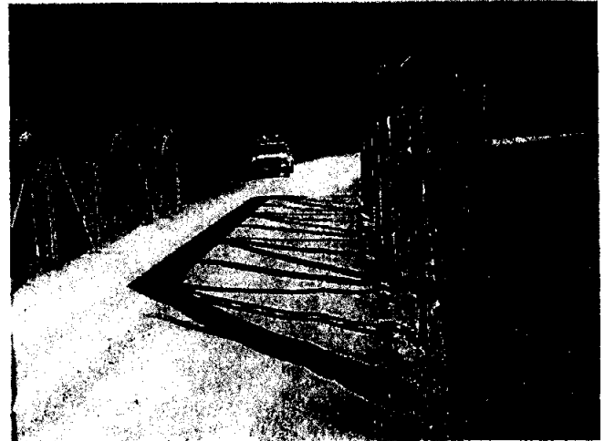
02-249-AA02-001 JEC 01-30-2008 Roberts Road (Pct.2) over Panther Creek Weight Limit Sign Missing Looking North